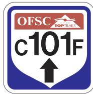
OFSC Top Trails