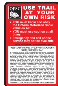
Use Trail at Own Risk

Different Sizes Available Different Colours Available