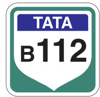
Top Trail Custom

I-24S: 12" x 12" Square Blue, Green & Black on White